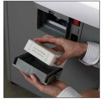
The DAHLE CleanTEC<sup>*</sup> filter traps up to 98% of the fine dust and provides a healthier work environment.

Just like any fine tuned machine, your shredder needs to be properly oiled to run at peak performance. This shredder is equipped with the Dahle EvenFlow Lubricator. This automatic oiler provides slow, continuous lubrication across the entire cutting mechanism and ensures peak shredder performance.