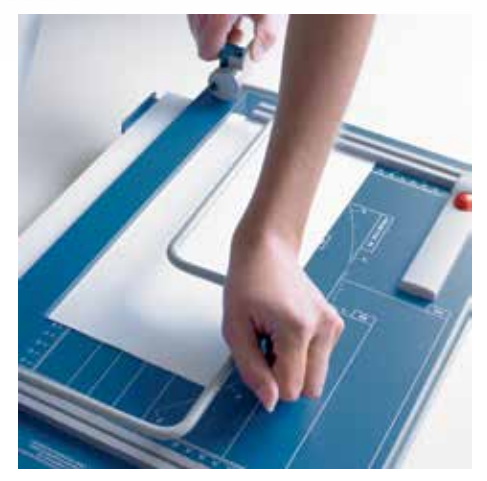
Manual D-bar clamp for holding item being cut perfectly in place