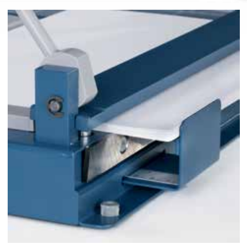
Powerful performance from Dahle model 564 for cutting up to 50 sheets