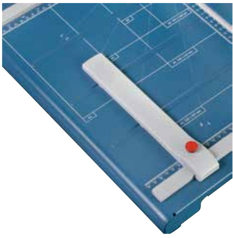
Adjustable backstop for quickly finding the right format can be used on both scale bars