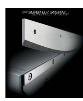
SUPER CUT SYSTEM Carbon hardened steel blades and counter-blades with 65° sharpening for long-lasting cutting operations