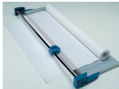
Convenient built-in paper rolls housing for easy cutting operations of large sizes of continuous paper