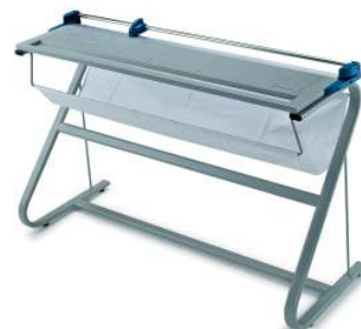
Can be delivered with its dedicated stand (option)