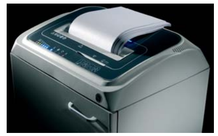
High shredding capacity Shreds up to 25* sheets of paper at a time. "AUTOMATIC REVERSE" System in case of iamming