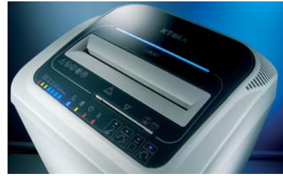
Touch Screen Panel

Just touch the controls to activate the machine functions. Keep your finger on the "Forward" control for 5 seconds and the machine functions continuously for 30 seconds when transparent material needs to be shredded. A visual signal notifies the operator when the blades should be lubricated for improved cutting capacity.