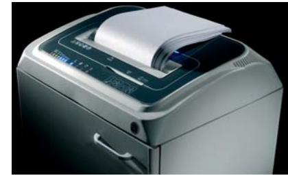
High shredding capacity Shreds up to 30* sheets of paper at a time. "AUTOMATIC REVERSE" System in case of jamming.